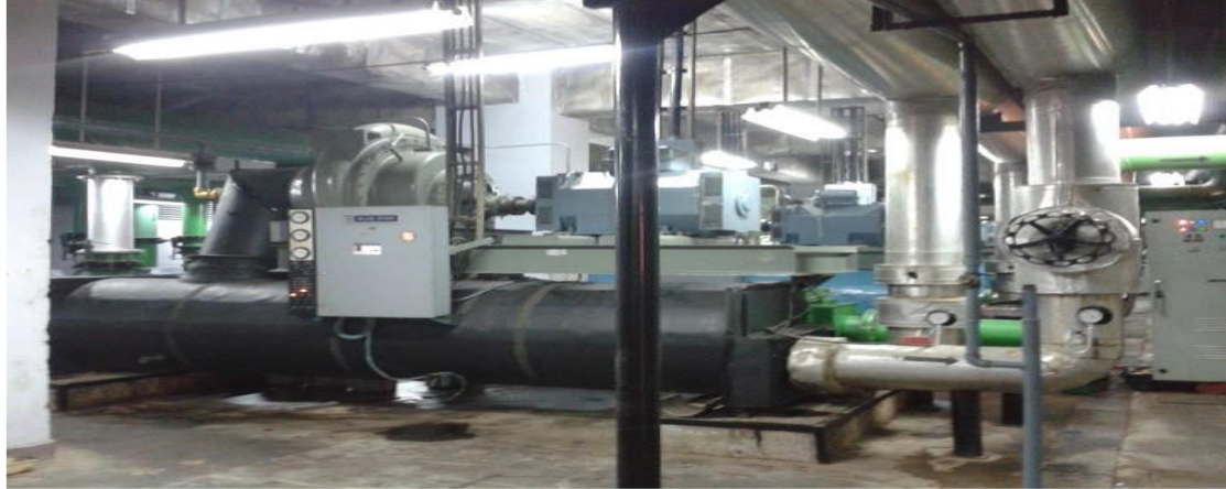
Fig.2: CHW chiller [3]

Here, total 2 nos. cooling towers (one for 340 TR system & one for VAHP) observed in plant for the cooling of the plant return water. In 340 TR system total 2 nos. cooling tower fan observed and for VAHP total 4 nos. cooling tower fan found.